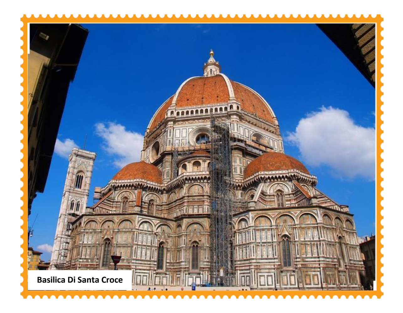
Day 13 Guided city tour of Florence. View the Duomo – Florence most iconic landmark. View the remarkable and famous Leaning Tower of Pisa.

Overnight stay at the hotel in Padova/Bologna/Ferrara. (Breakfast, Lunch, Dinner)