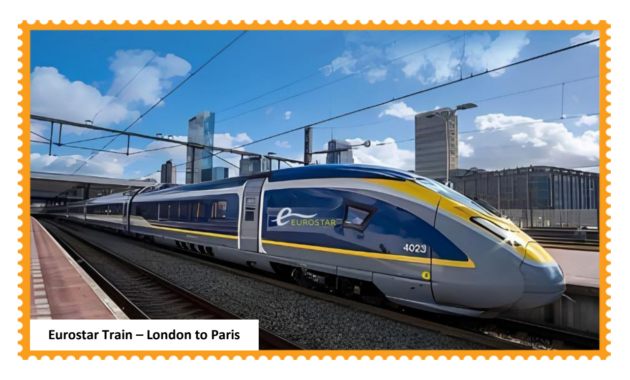
Day 3 Visit to the famous Madame Tussauds Wax museum. Proceed to Paris - the City of Romance, Lights and Glamour.

Check out of your hotel as we proceed to visit the renowned Madame Tussauds wax museum. Be enthralled by the world's largest wax collection of famous personalities. Later we proceed to travel by high speed train from London to Paris. Eurostar is a high-speed train service connecting London with Paris through the Channel Tunnel. En route enjoy the English and French Countryside. Offering a swift and efficient journey, it provides a seamless travel experience between these iconic European cities. After disembarking proceed to the fashionable and elegant city Paris, known for its haute couture, renowned museums, breath-taking beautiful monuments and sensational cabarets.