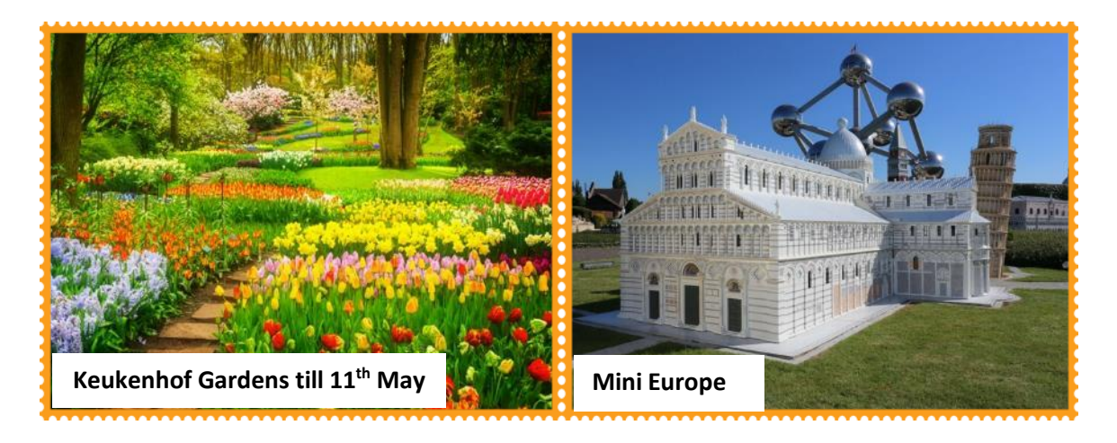
Day 6 Onto Brussels. Visit Grand Place and Manneken Pis statue. Visit the miniature park – Mini Europe.

Important Note – Keeping in mind the logistical consideration the Tour Manager reserves the right to alter or change the itinerary.