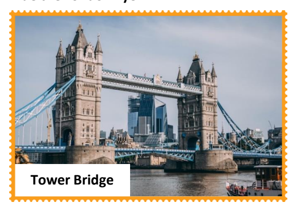
Day 2 Guided city tour of London with Changing of Guards. Visit the legendary Lord's Cricket Ground. Ride the London Eye.

Overnight stay at the hotel in London. (Dinner)