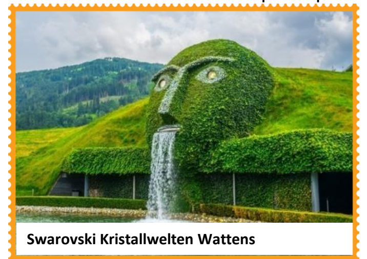
Day 11 Drive to Vaduz, the capital at the Principality of Liechtenstein with a guided mini train ride. Visit Swarovski Crystal Museum – the dazzling world of crystals. Visit Innsbruck – The Tyrolean capital of picturesque Austria.

Today after breakfast, Relax in your coach as you take a scenic drive to Innsbruck. Enroute arrive in Vaduz, the of Liechtenstein, principality nestled between Switzerland and Austria. It lies entirely within the Alps and covering an area of just sixtytwo square miles. Liechtenstein is the sixth smallest independent nation in the world. It follows a policy of neutrality and is one of the few countries in the world that maintains no military. The Vaduz train ride offers a serene and immersive way to appreciate the natural beauty and idyllic surroundings