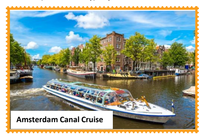
Day 7 Visit Keukenhof Gardens (till 11th May). Visit picturesque Dutch Village of Windmills and Tradition (from 12<sup>th</sup> May). Explore Amsterdam with Canal Cruise.

Drive to Germany. Check out and later we relax in our coach as we travel to the charming city of Lisse. we'll have the incredible opportunity to visit the renowned Keukenhof Gardens, open until May 11th. Prepare to be mesmerized by the vast tulips, daffodils, displays of hyacinths, creating a breathtaking array of colours. From 12<sup>th</sup> May we proceed to charming Dutch village near Amsterdam known for its iconic windmills, traditional wooden houses, and artisan workshops,