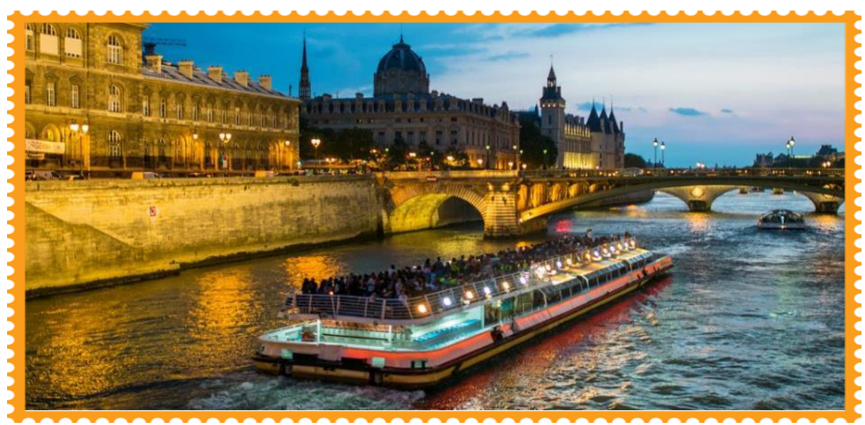
Tower, Place de la Concorde, Champs-Élysées, and the Arc de Triomphe and many more. Overnight stay at the hotel in Paris. (Breakfast, Lunch, Dinner)

Dame, the Eiffel Tower, the Louvre, the Orsay Museum, and many more. Glide gracefully under one picturesque bridge after another, enjoying views of the finest monuments in the heart of bustling Paris. After the cruise, we proceed for a captivating and enchanting experience to witness the City of Light in all its night time splendour. Paris, often referred to as the "City of Light". See some of Paris's most famous landmarks, all bathed in a soft, golden glow. These might include the Eiffel